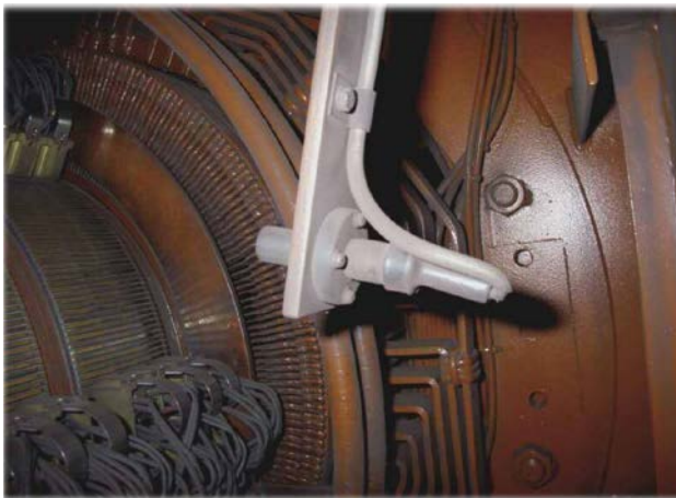
The flame sensor is installed on the DC motor in the photo.