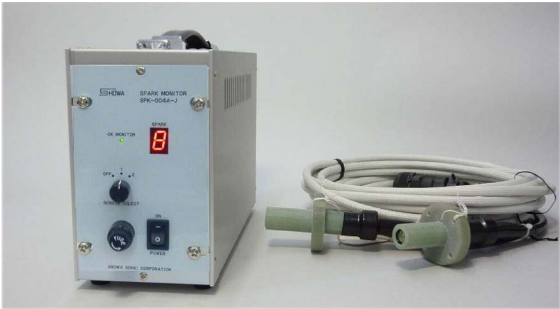
Spark Monitoring System and Flame Sensor UV TRON