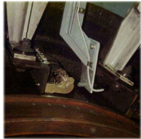
The flame sensor is installed on the blooming mill motor